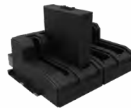
4-bay Battery Charger