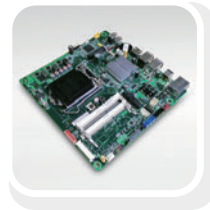
Skylake / Kabylake H110