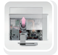
Easy removable cover