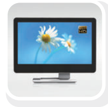
Full HD Display